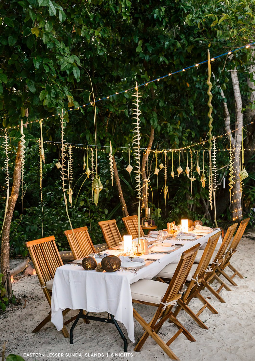
EASTERN LESSER SUNDA ISLANDS | 6 NIGHTS