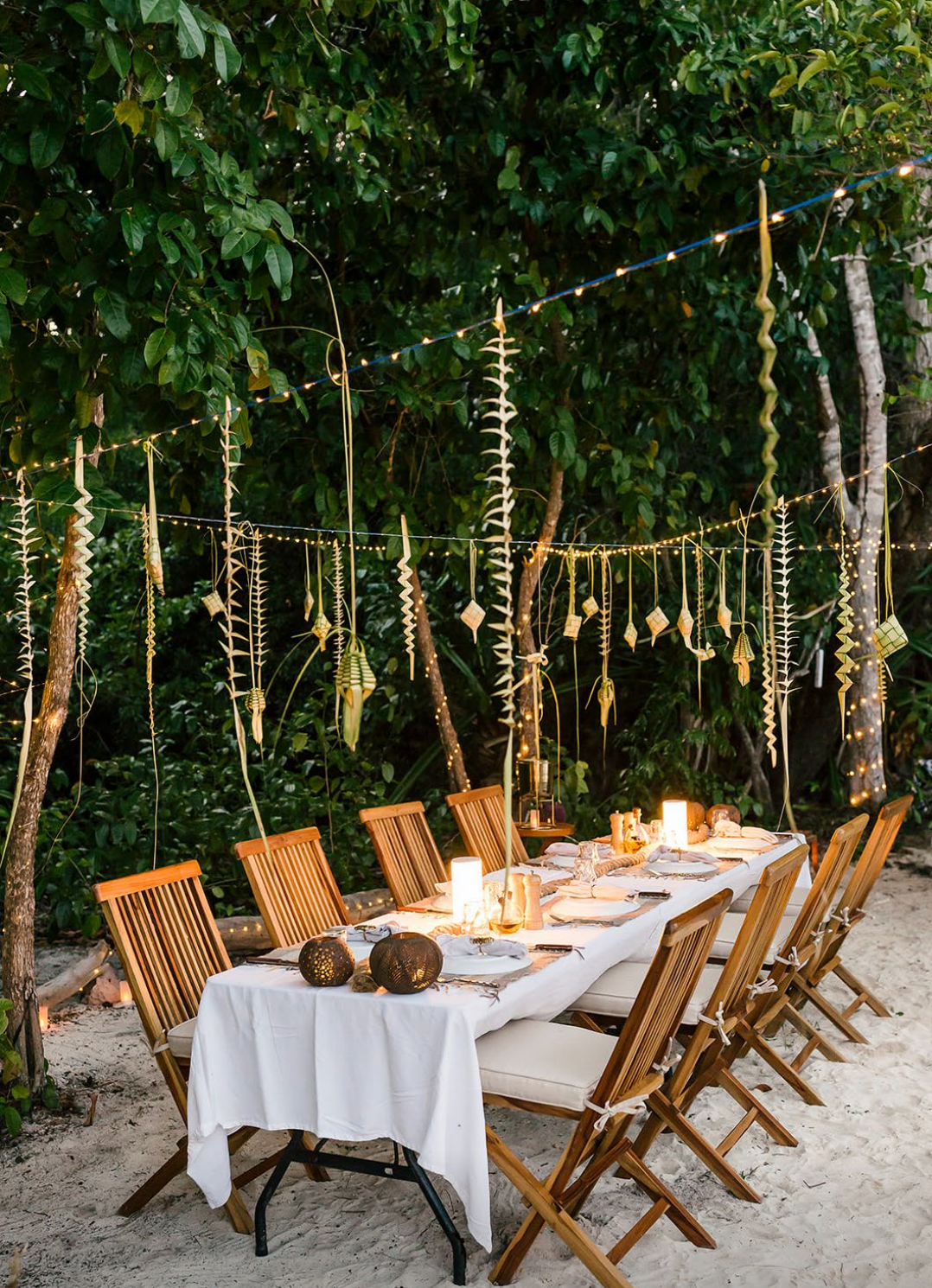
KOMODO NATIONAL PARK | 4 NIGHTS