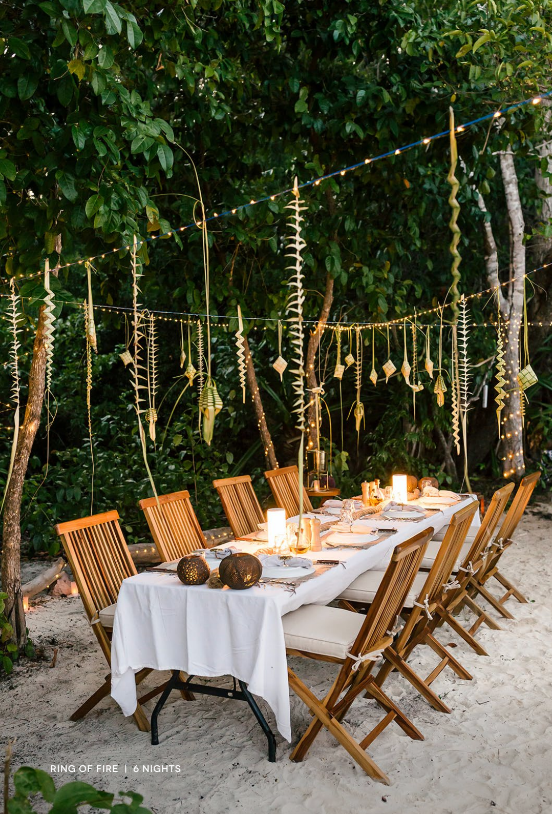
RING OF FIRE | 6 NIGHTS